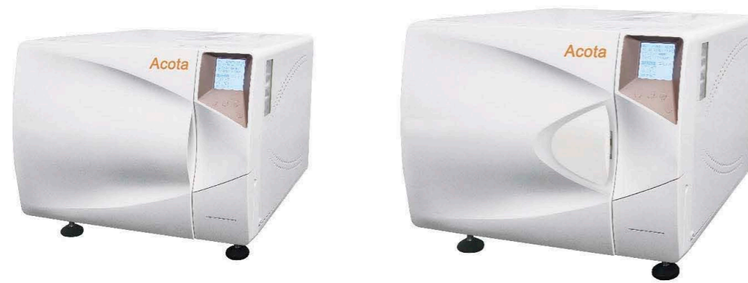
18/ 24 / 45L

MAST-T series: T18/24/45/80 is a Class B tabletop sterilizer. As a type of high pressure sterilizer, it takes steam as its sterilization medium which is fast, safe and economic. They are common used in stomatological department, ophthalmological department, operating room and CSSD to make the sterilization for warped or unwrapped instrument, fabric, utensils, culture medium, unsealed liquid, etc. The design of chamber accords with state GB1502011, GB8599-2008, CE and EN285 standard.